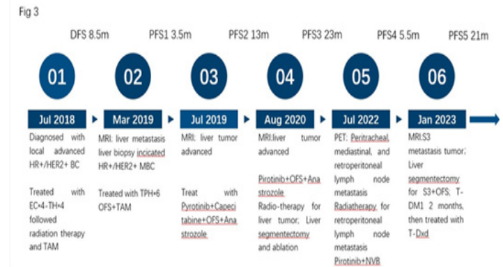
Figure 3: Timeline of treatment for breast cancer patients.

In January 2023, an MRI indicated a new tumor in liver segment S3, confirmed by PET-CT. A liver segmentectomy was performed, with pathology results showing ER+, PR-, and HER2+. The patient was treated with OFS and TDM1, and in July 2023, the medication was switched to T-Dxd plus oophorectomy. By September, MRI and CT scans indicated a good response in the lymph nodes, with no new lesions developing, the total timeline of treatment for breast cancer patients as shown in (Figure 3).