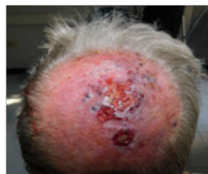
Figure 1: Hard violaceous nodules over a erythematous-violaceous indurated ecchymotic plaque with ulcerations on the top of the head.

Due to patient's disease extension and poor performance status, short radiotherapy cycle was performed as palliative therapy. He was transitioned to home hospice where he died one month later.